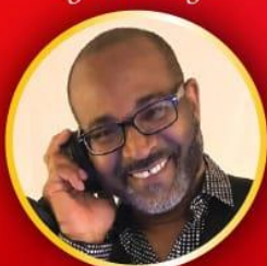
DJ Extreme ATL